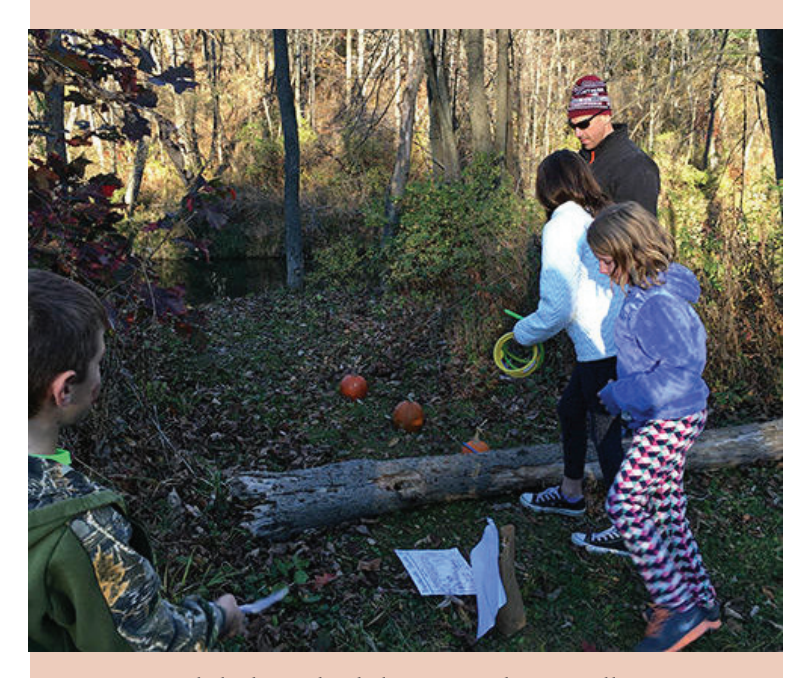
Both kids and adults enjoyed Boo Ville at the Haunted River.